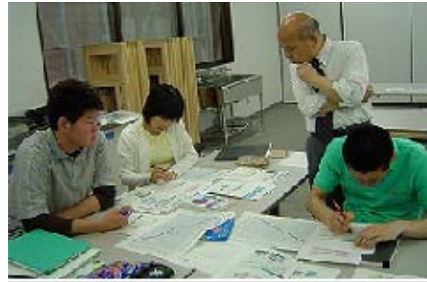
The situation of a lesson